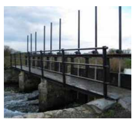
Water level control structures