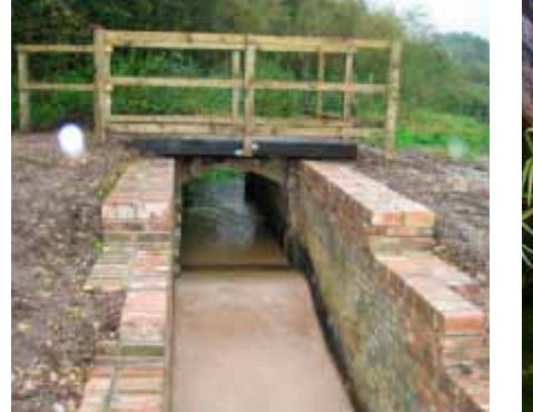
Side channel off take