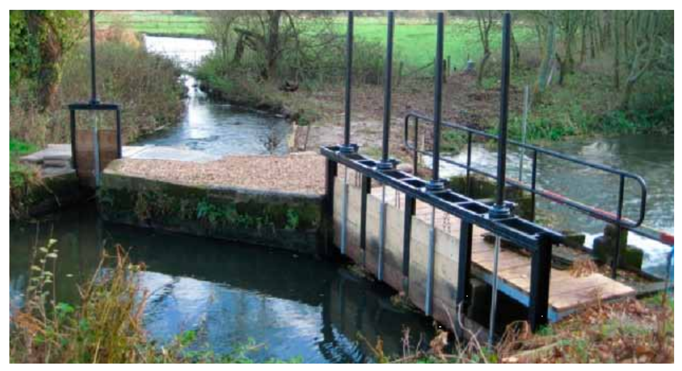
Hyford Hatches: restored allowing more effective and safe water level management through operation control.

Delivered by: Environment Agency Partners: Natural England, Royal HaskoningDHV (to appraise and design projects); Dyer and Butler and Kingcombe (construction).