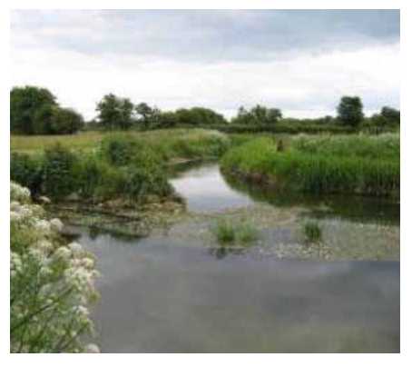
Side channel management

Structure Operation Protocols (SOPs) were developed and agreed for all existing and installed structures, and were delivered in 2010/2011. These aim to gain agreement as to their future operation to maintain or improve SSSI condition. The River Frome Flow and Structure Project was initiated in 2010/11 to help formulate the SOPs, and also inform river restoration action appraisal.