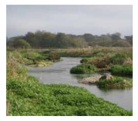
River restoration pilot

The Moreton Channel project aimed to reprofile morphologically uniform sections of the river bed (using a long reach excavator). Through moving existing gravels a variety features were created including; deep pools, gullies, riffles and exposed gravel berms.